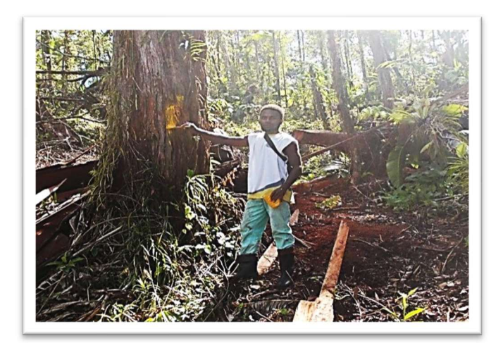
Photo 2: Falake community member participant to survey of pilot activity boundary area painting a tree along the boundary line.